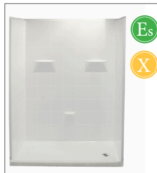
MP 6033 SH 5P 4.0 L/R OD: 60" x 33.375" x 79.5" Enclosure: up to 57.75" x 71"