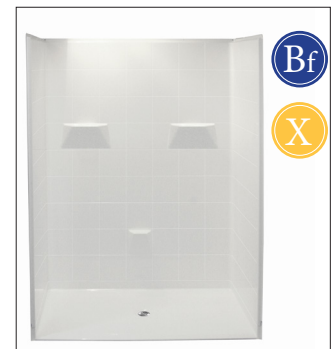
MP 6036 BF 5P .875 C OD: 60" x 37" x 78" Enclosure: up to 57.75" x 72.75"