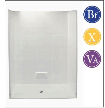
MP 5050 BF 5P 1.0 C OD: 50.25" x 50.125" x 77.75" Enclosure: up to 48.25" x 75.75"