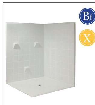
MP 6060 BF DE 3P 1.25 C OD: 61" x 61" x 78" Enclosure: up to 57.75" x 57.75" x 72.5"