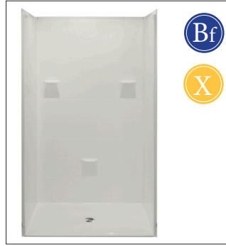
MP 4836 BF 4P .875 C OD: 48" x 37" x 78" Enclosure: up to 45.75" x 72.75"