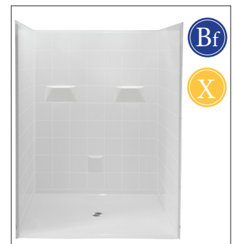
MP 6060 BF 5P 1.125 C OD: 60" x 61" x 78" Enclosure: up to 57.75" x 72.75"