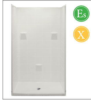
MP 4836 SH 4P 3.0 C OD: 48" x 37" x 78" Enclosure: up to 45.75" x 72.75"