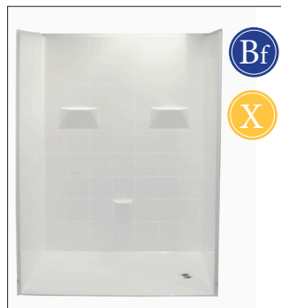
MP 6033 BF 5P 1.0 L/R OD: 60" x 33.375" x 78" Enclosure: up to 57.625" x 72.75"