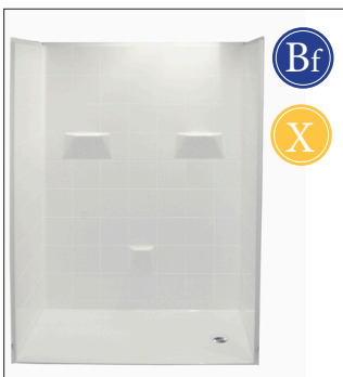
MP 6036 BF 5P 1.0 L/R OD: 60" x 36.875" x 78.125" Enclosure: up to 57.5" x 72.75"