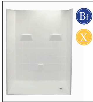
MP 6030 BF 5P 1.0 L/R OD: 60" x 31" x 78" Enclosure: up to 57.75" x 72.75"