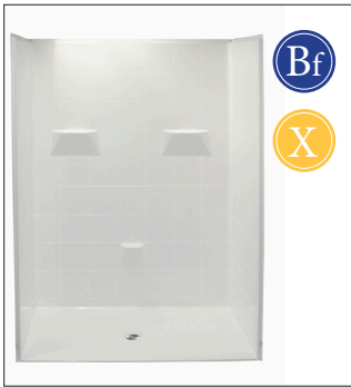
MP 6030 BF 5P .75 C OD: 60" x 31" x 77.75" Enclosure: up to 57.75" x 72.75"