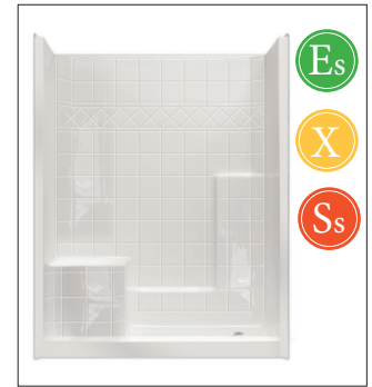
MP 6032 SH IS 3P 4.0 L/R OD: 60" x 33" x 77" Enclosure: up to 55.75" x 71"