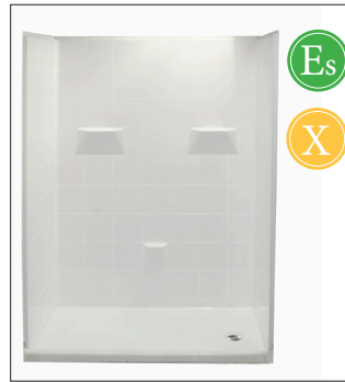
MP 6030 SH 5P 4.0 L/R OD: 60" x 31" x 79.5" Enclosure: up to 57.75" x 71"