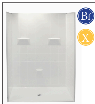
MP 6048 BF 5P 1.125 C OD: 60" x 49" x 78" Enclosure: up to 57.75" x 72.75"