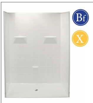
MP 6033 BF 5P .75 C OD: 60" x 33.375" x 78" Enclosure: up to 57.625" x 72.75"