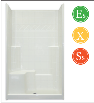
MP 3648 SH IS 3P 4.0 L/R OD: 48" x 37" x 79.5" Enclosure: up to 45" x 74"